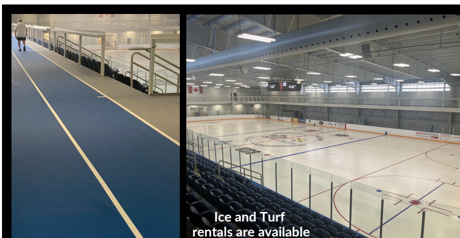
Ice and Turf rentals are available

Application & info at www.westhants.ca/regional-fire-service.html