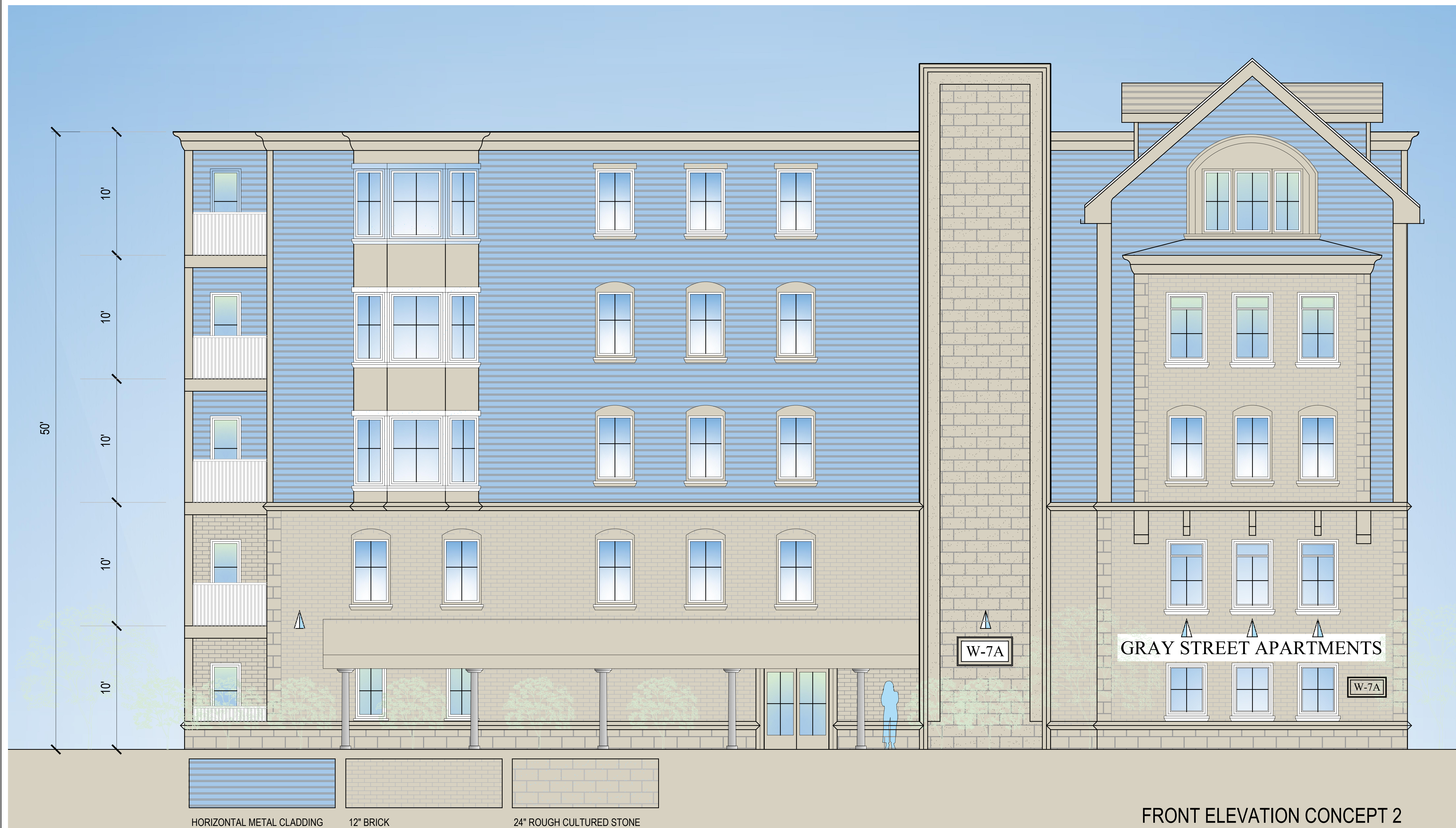
FRONT ELEVATION CONCEPT 2