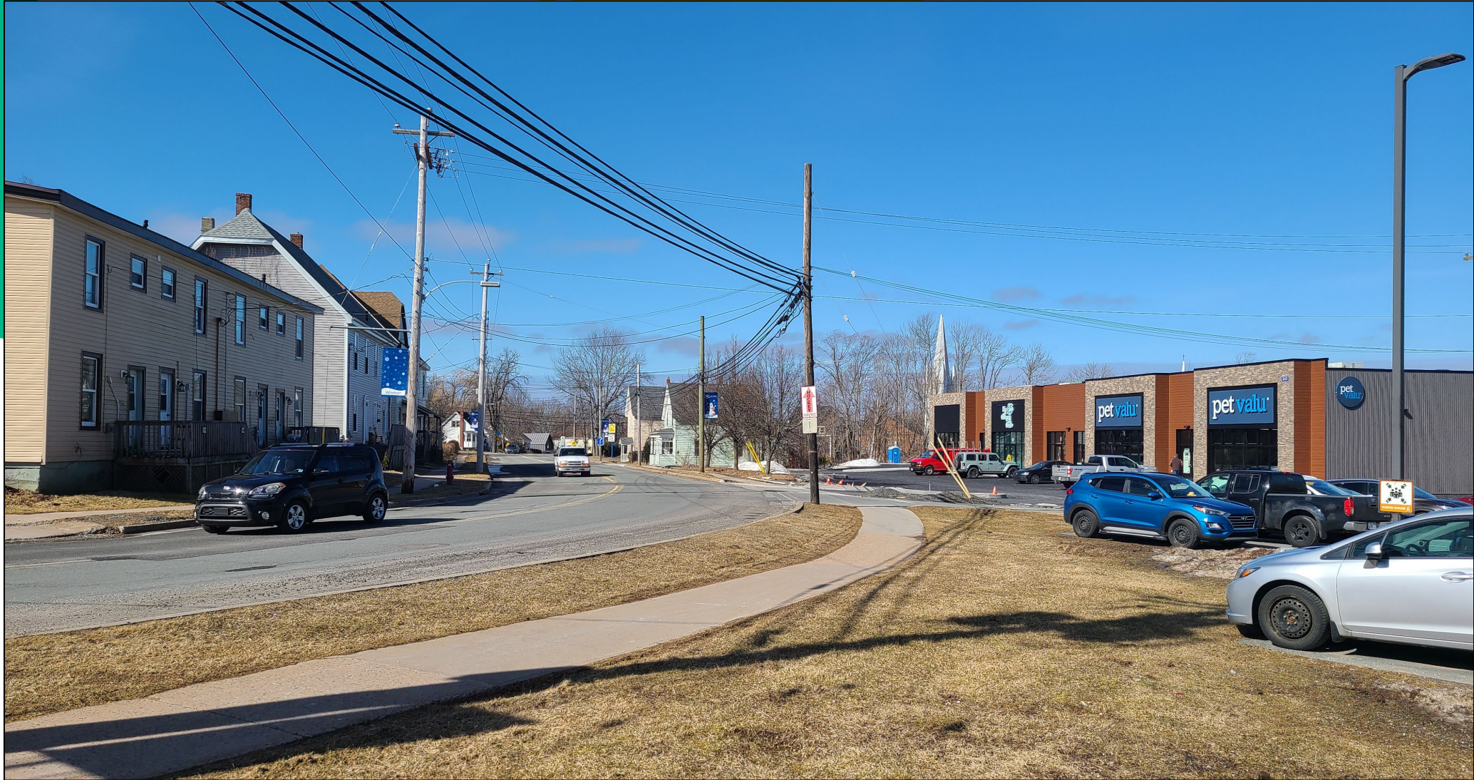
View across from Subject Lot