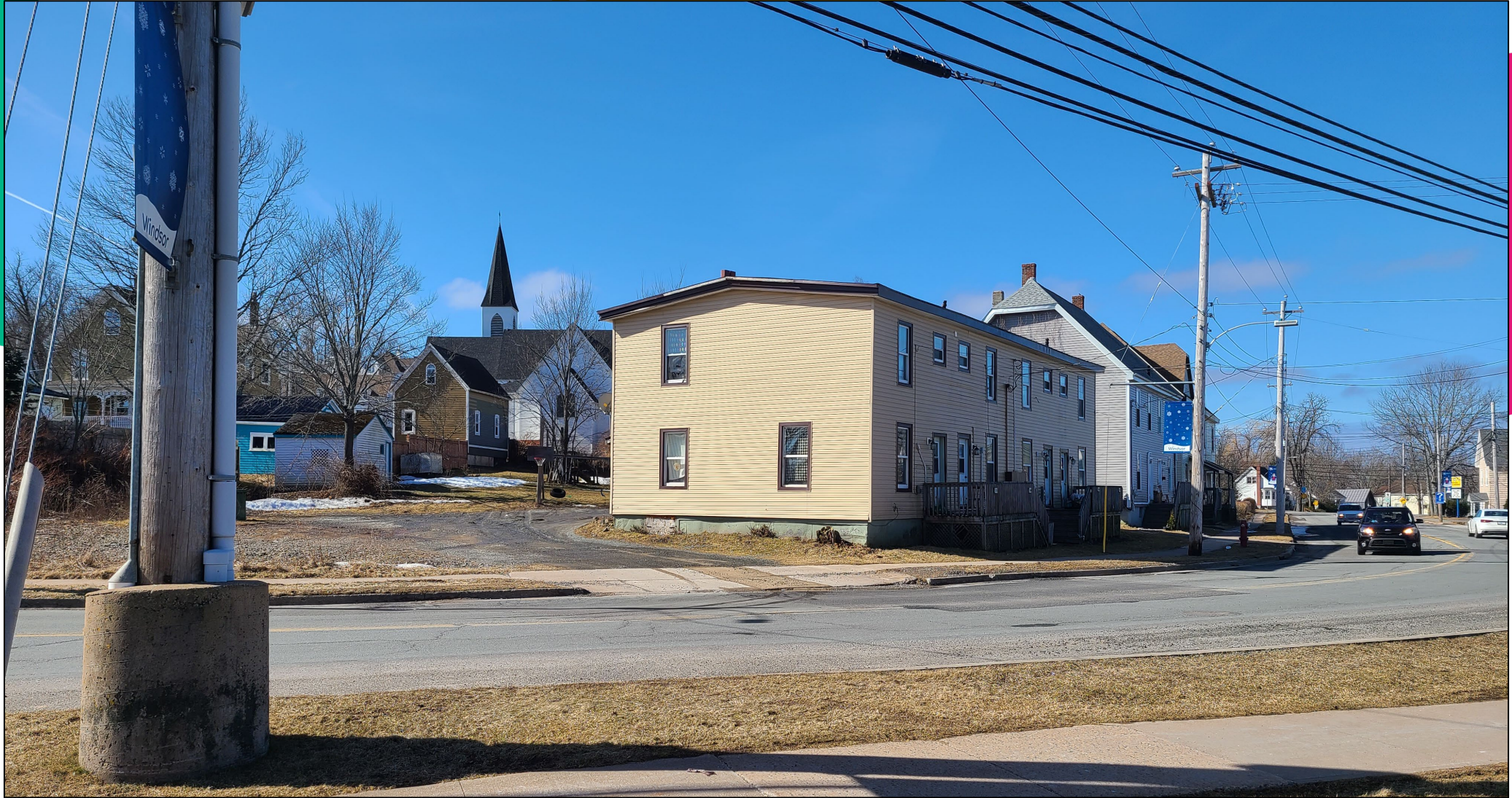
View of Subject Lot