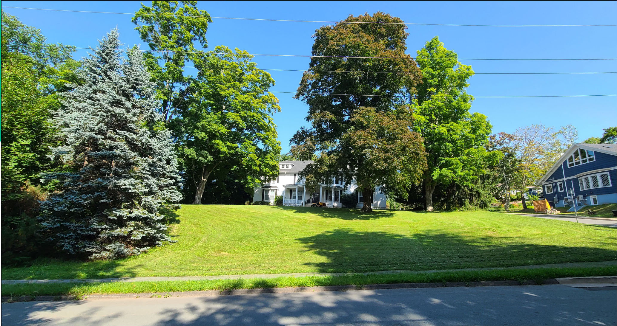
View of Subject Lot from Clifton Avenue