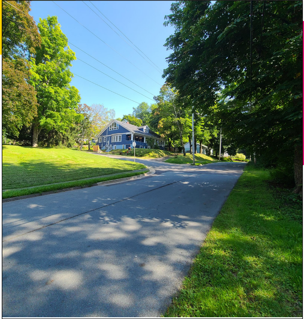
View of surrounding uses on Clifton Avenue