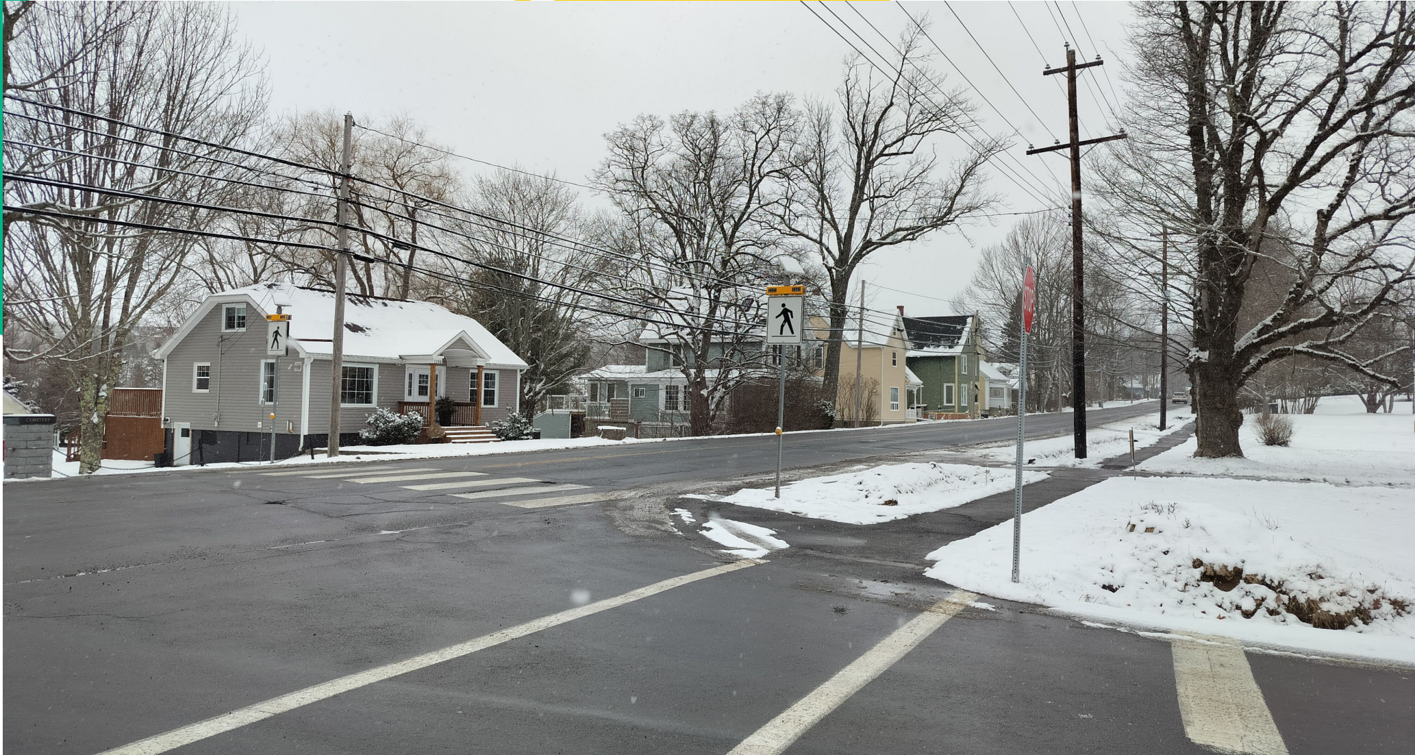
View of Surrounding Area on King Street