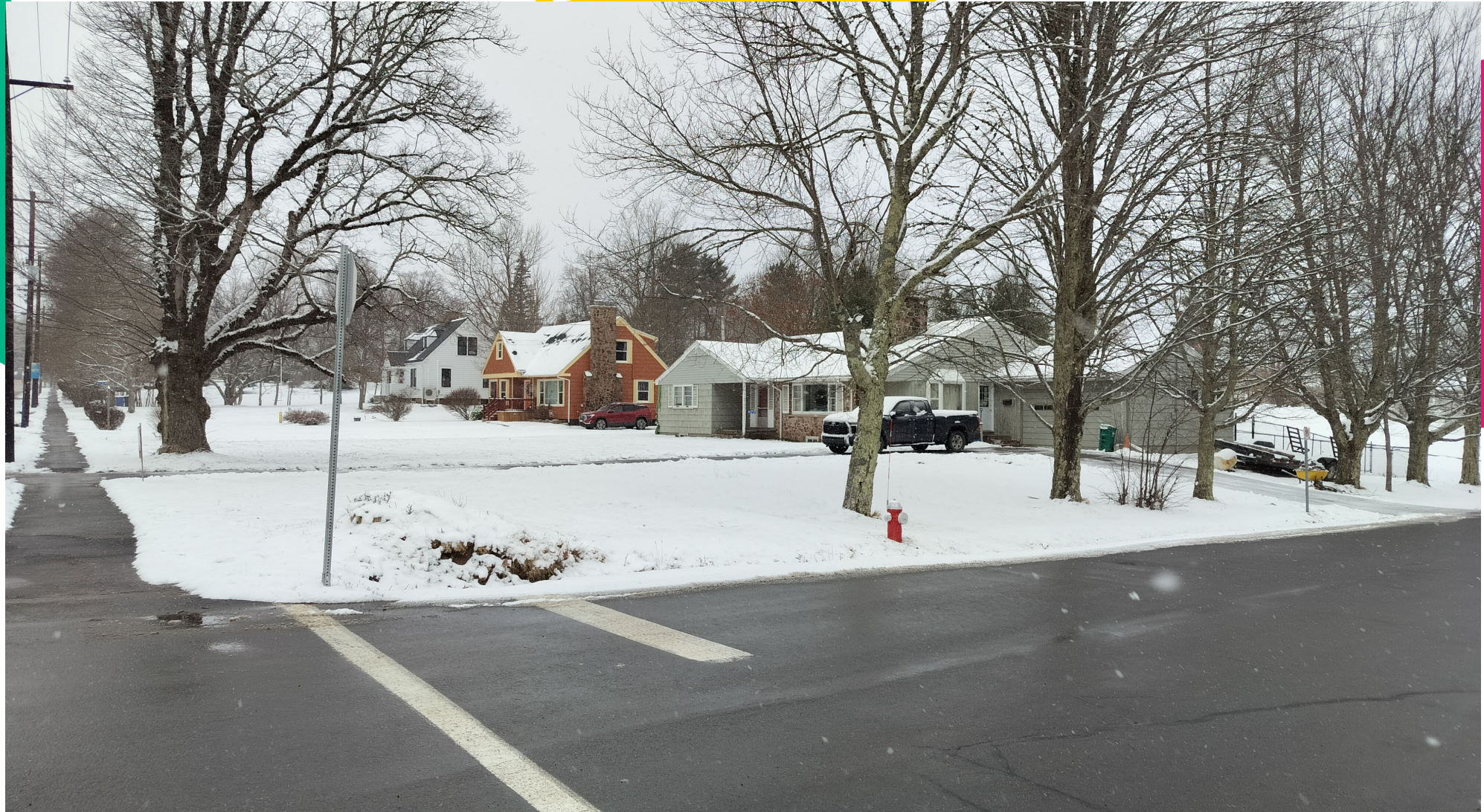
View of Subject Lot from Tremain Crescent