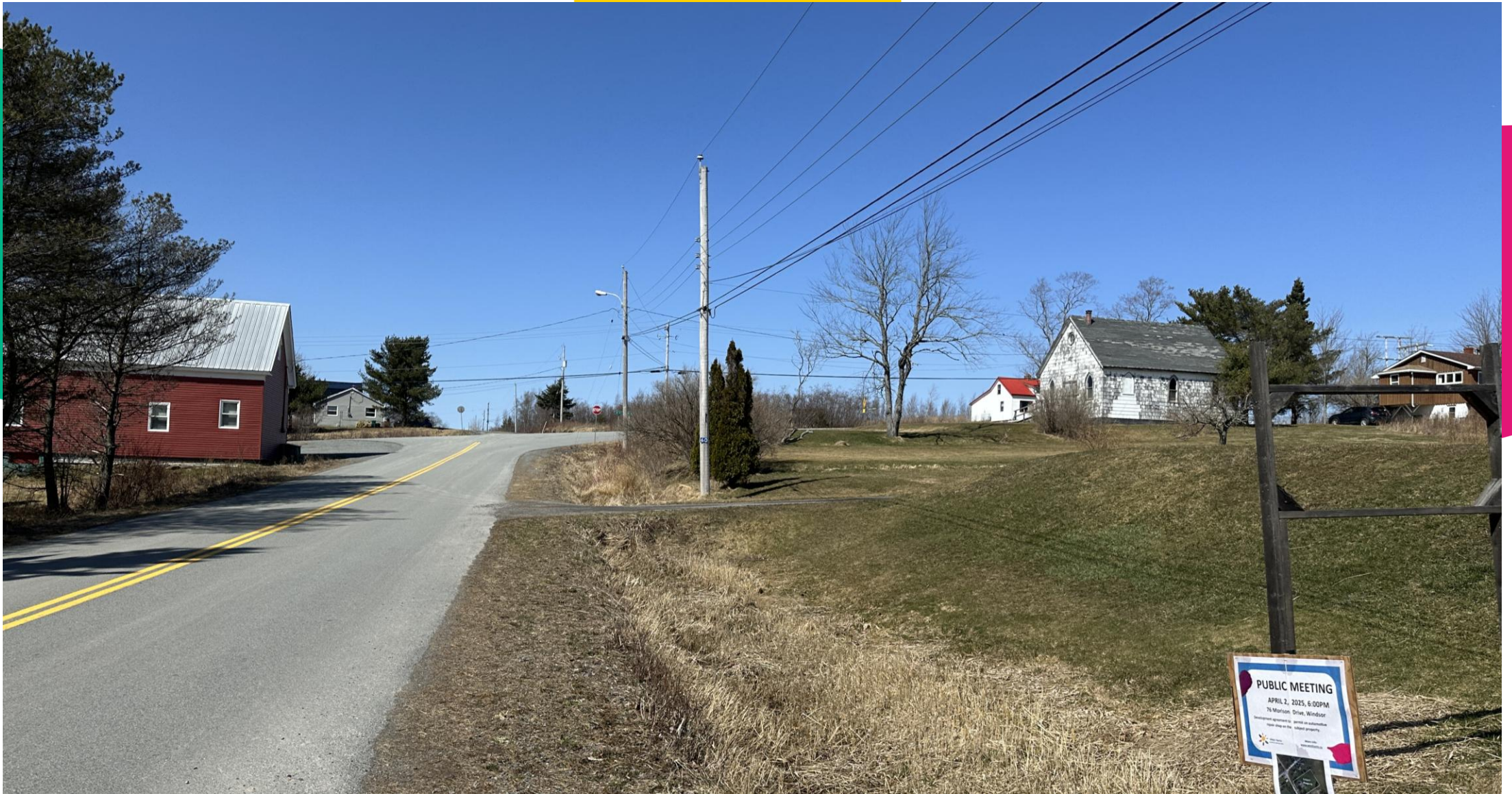
View of Old Walton Road from Subject Lot Access