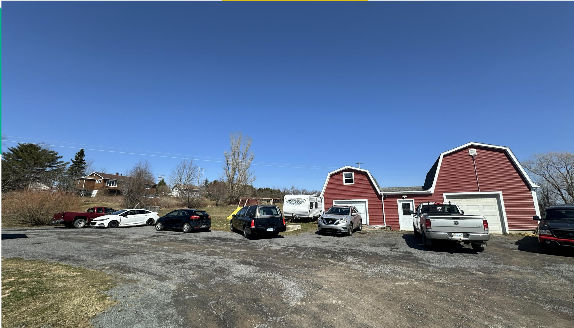
View of Proposed Development Location on Subject Lot