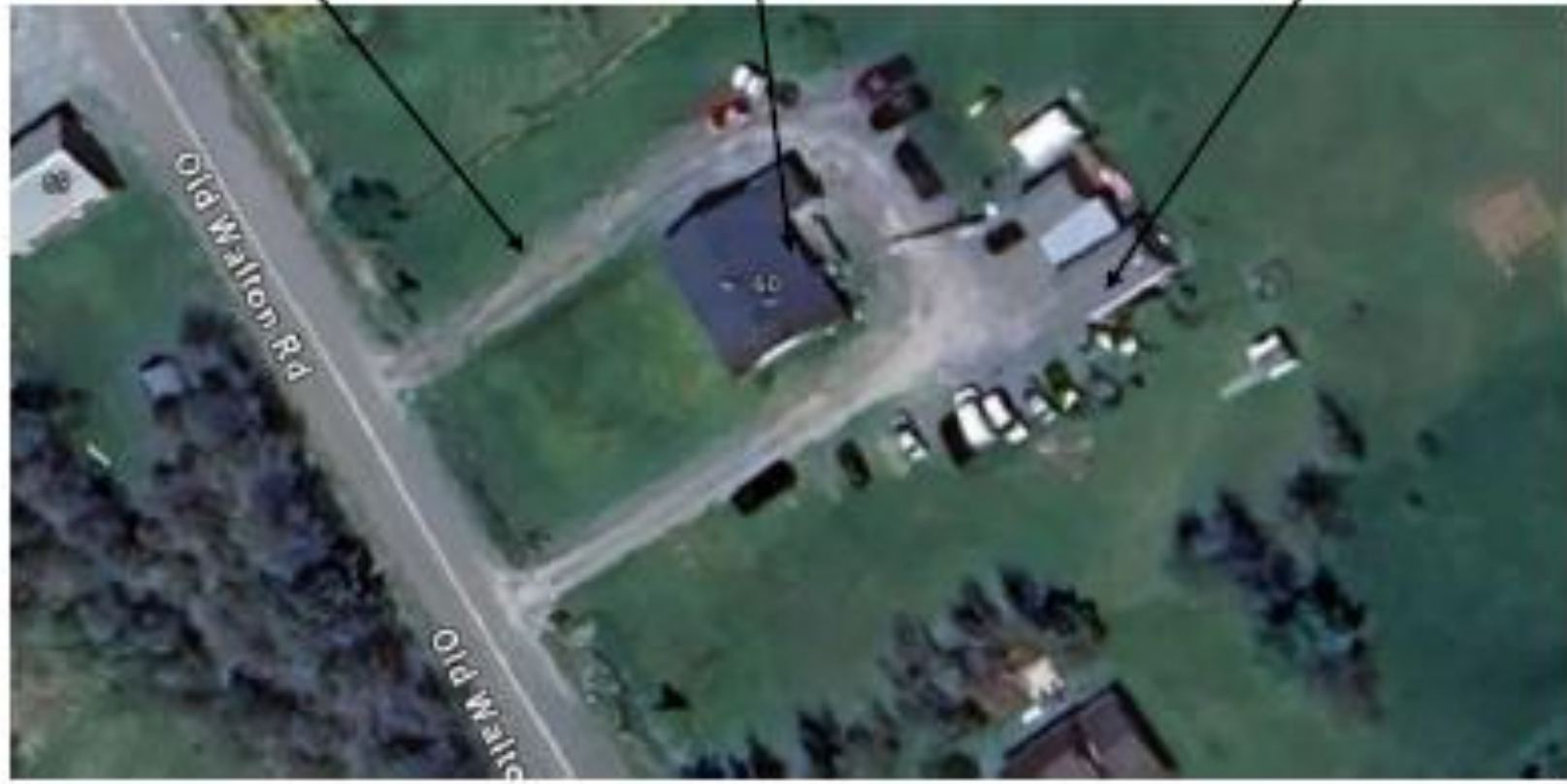
Site Plan for the development